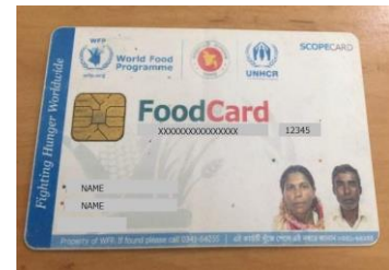
Example of e-voucher

<About “euglena GENKI program” and “mung bean project”>