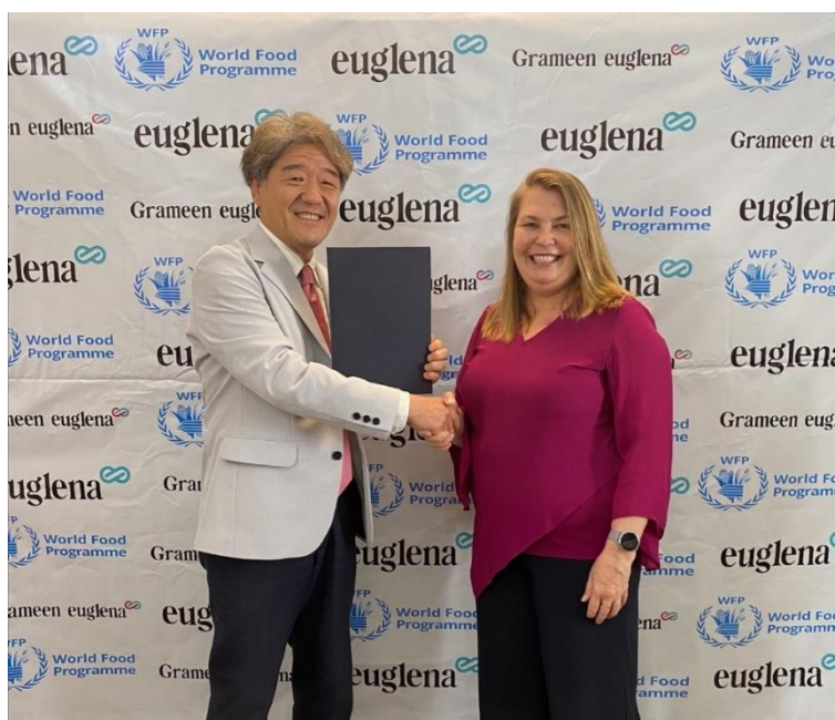
Photo at the signing ceremony in Bangladesh

*3 A large number of refugees from Myanmar entered Cox's Bazar in southeastern Bangladesh, and currently, about one million people live in refugee camps.